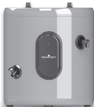
Floor Standing ("L" Models)