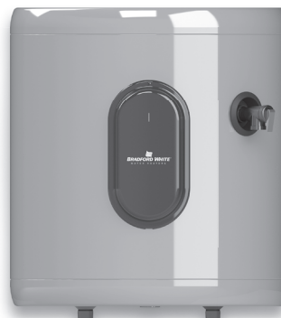
Wall Hung ("WH" Models)