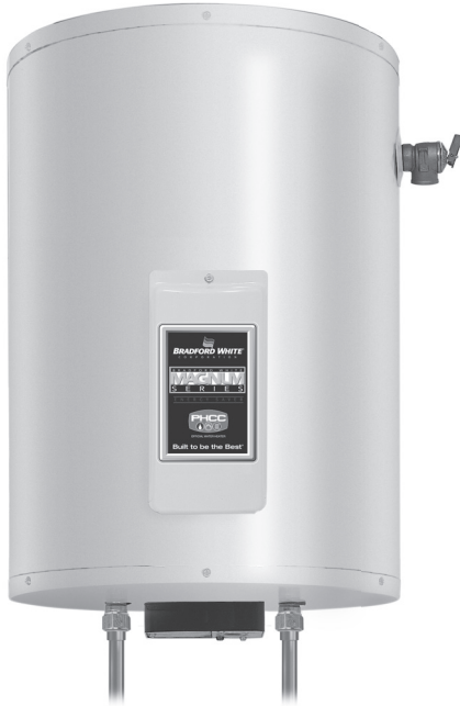
Photo is of LE16WV3-1